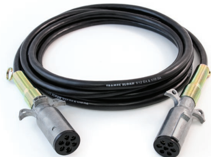
46A15: Straight Standard Cable, 1/10-6-12 Gauge, Black Jacket, 15'