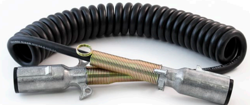
47A15: Coiled Standard Cable, 1/12-6-14 Gauge, Black Jacket, 15' with Two 12" Leads