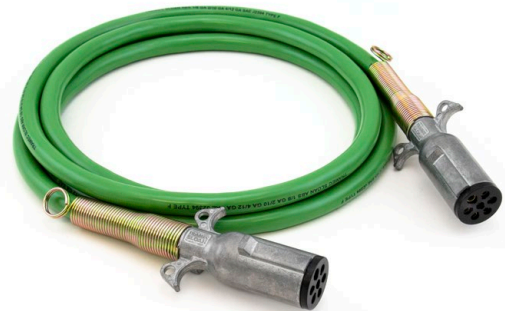
4CA12: Straight ABS Cable with Standard Jacket, 12'