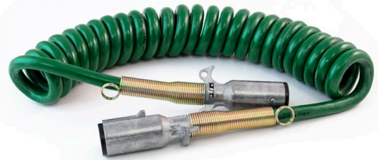
4AA15: Coiled ABS Cable with XT Jacket, 15' with Two 12" Leads