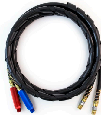
455144ASETW - No prefix keeps the 12ft hoses black. The suffix "ASETW" adds aluminum grips, makes it a pair of hoses instead of one, and adds spiral wrap.