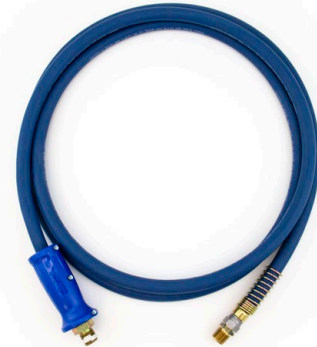
B455144B - The prefix "B" changes the 12ft base hose to blue and the suffix "B" adds a blue Dura-Grip