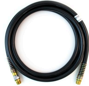
455144 - Base part number only. 12ft black hose with no handles, just 1/2" fittings

Need a custom length, a non-standard component, or something else? Just give Customer Service a call and chances are, we can have your unique hose built for you in just 48 hours.