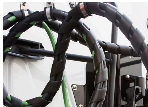
Wrapped air and electrical lines stay organized and are more protected from damage.