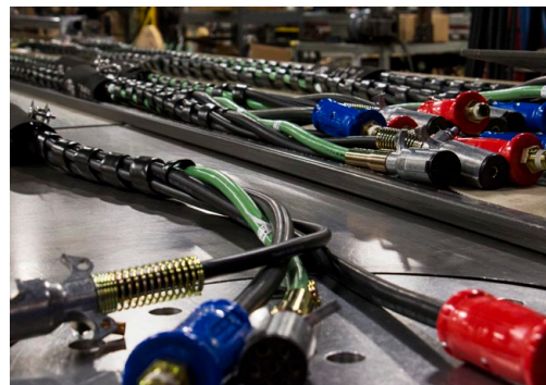
Custom Created for You: Each wrap is built to order with the exact combination of features you require.