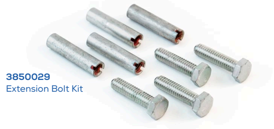
3850029 Extension Bolt Kit

* Deep Receptacles are 16% deeper than standard to allow max depth function for J560 plug and a more secure connection