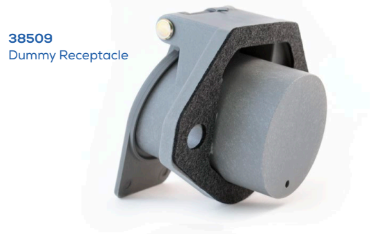
38509 Dummy Receptacle