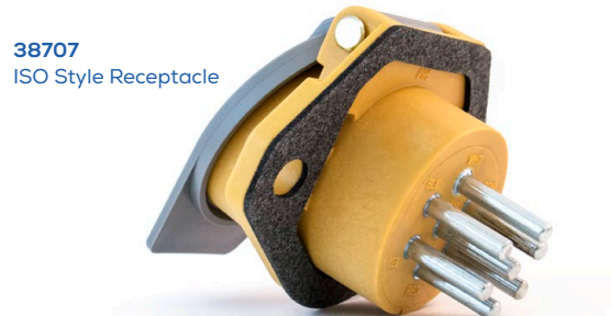
38707 ISO Style Receptacle