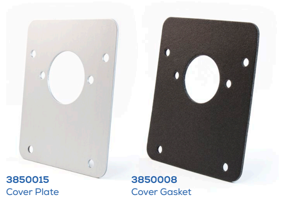
3850015 Cover Plate