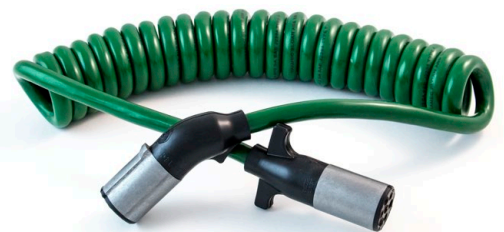
4A115: Coiled ABS Cable with XT Jacket, One Angled Plug, Zinc Sleeves, 15' with Two 12" Leads

HEAVY DUTY XT JACKET: Provides Superior Cut, Tear & Abrasion Resistance. Plus, Excellent Coil Retention & Flexibility in Both Cold & Warm Weather Extremes.