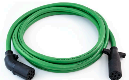
4CD12: Straight ABS Cable with Standard Jacket, One Angled Plug, Nylon Sleeves, 12' Length