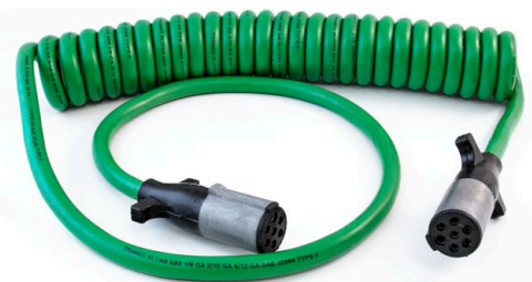
4D017: Coiled ABS Cable with Standard Jacket, Two Straight Plugs, Zinc Sleeves, 15' with One 48" Lead