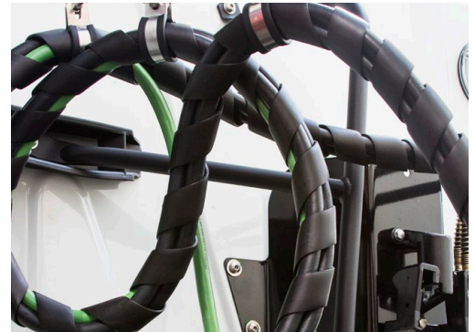
Wrapped air and electrical lines stay organized and are more protected from damage.