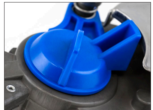
Color-coded swivel cover provides protection while uncoupled.