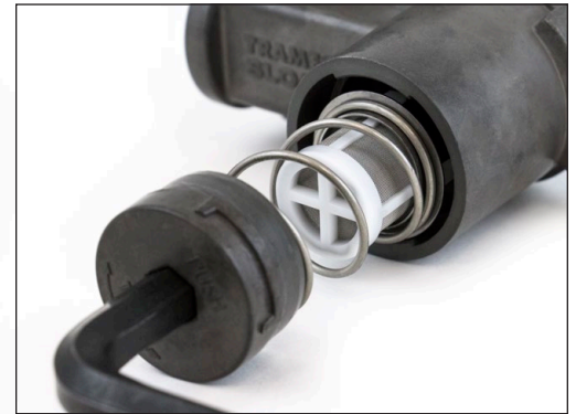
Maintenance is easy and requires only a 3/8" hex key.

Designed for simplified air line protection, these gladhands from Tramec Sloan feature an integrated filter built into the body. The serviceable filter cartridge captures contaminants and allows air to bypass if clogged.