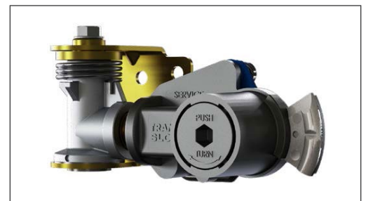
Straight style available on 45° and 90° swivel mounts.