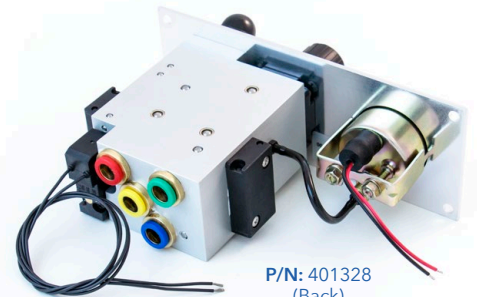
P/N: 401328 (Back)

Parker has developed a series of lift axle control panels for use with the industry's leading lift axles. They can be mounted in cab or externally on trucks and trailers. Reliability and smooth operation come together in these complete systems. Tramec Sloan now carries these kits or replacement components for your lift axle module. See our selection of toggle switches, valves, cabinets, and other accessories.